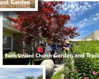
Faith United Church Garden and Trails