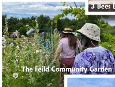
The Feild Community Garden