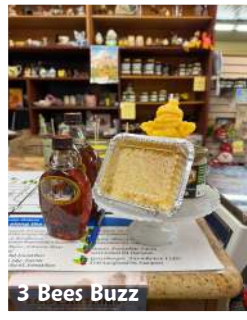
3 Bees Buzz

3 Bees Buzz was our next stop, situated down a long gravel road, in an idyllic and peaceful location, perfect for apiculture. We split into groups as half of us headed inside to the shop, formerly a barn. For sale was delicious wildflower honey, including one made