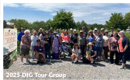
2025 DIG Tour Group

of sunflower nectar—nutty and rich. Outside, the other half of the group learned more about beekeeping, sheltered from the hot sun.