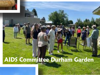
AIDS Committee Durham Garden